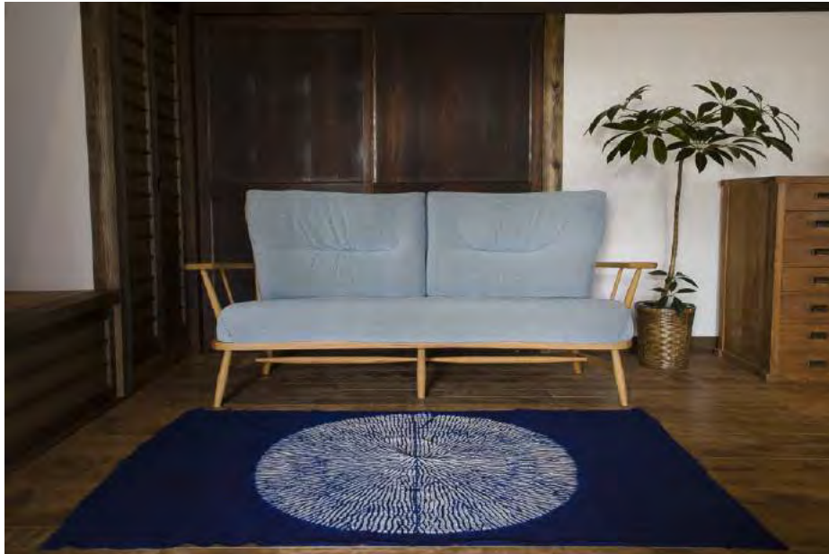
PILS-01 玄関ラグ唐松絞り / Rug "Karamatsu shibori"