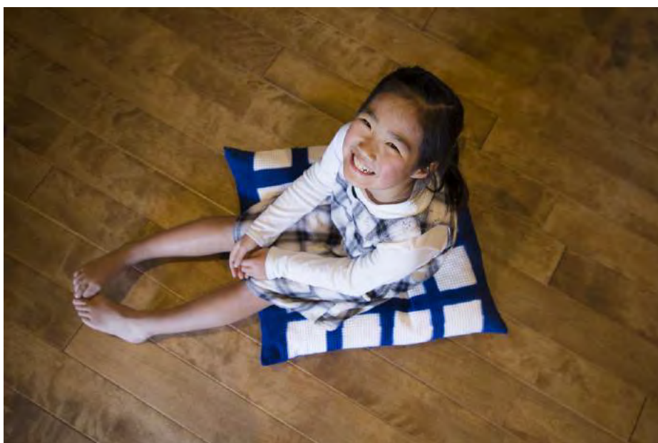
PILS-04 クッション四角 板締め絞り Cushion "Itajime shibori"