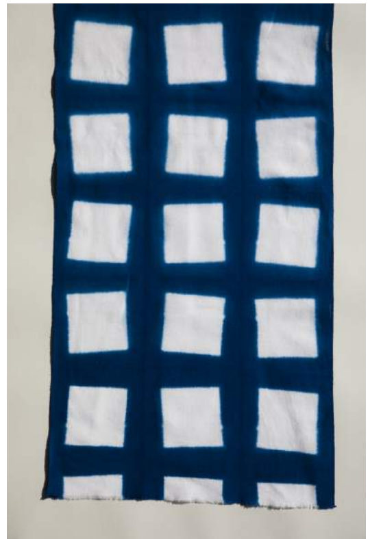
PIT-06 板締め絞り - 四角 - “Itajime shibori -Shikaku-”