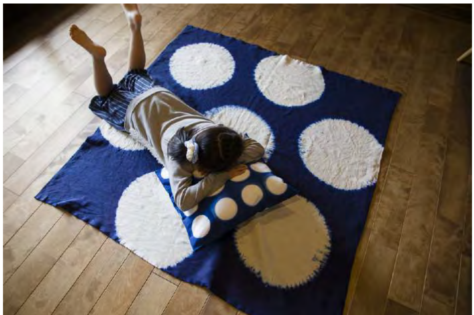
PILS-03 クッション丸 板締め絞り cushion "Itajime shibori"