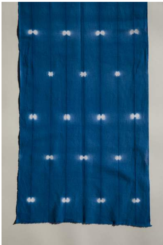
PI-T-07 蛍絞り “Hotaru shibori” fireflies Traditional Limited Edition