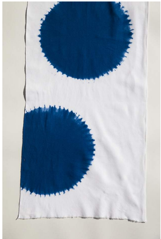
PIT-02 大帽子絞り “Oh-boushi shibori”