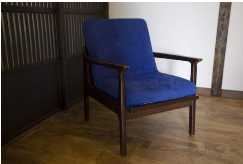
PILS-04 チェア染めサンプル "Indigo Some "