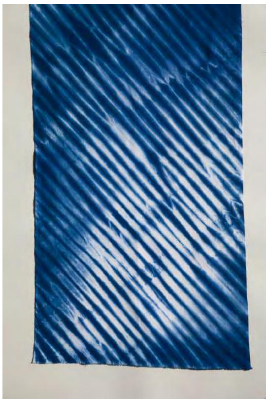
PIT-03 嵐絞り “Arashi shibori”