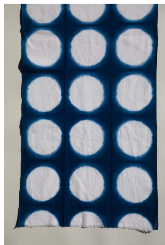
PIT-04 板締め絞り - 丸 “Itajime shibori -Maru-”