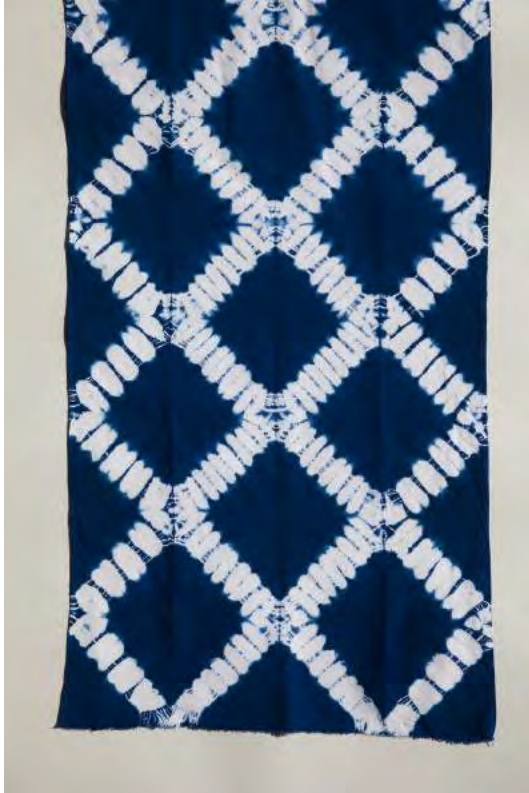
PIT-09 海鼠絞り “Namako shibori” A pattern of Japanese traditional mud wall