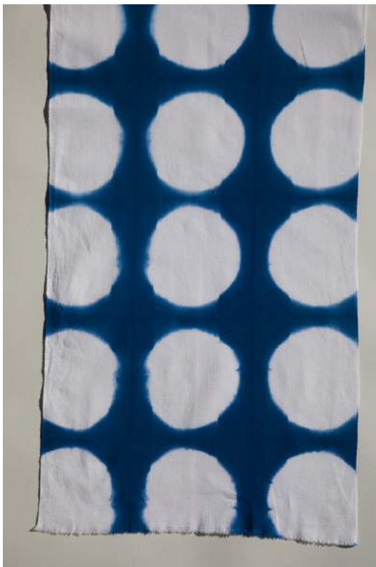
PIT-011 (左下) 板締め絞り - 丸 - “Itajime shibori -Maru-” clamping with boards -Circles-