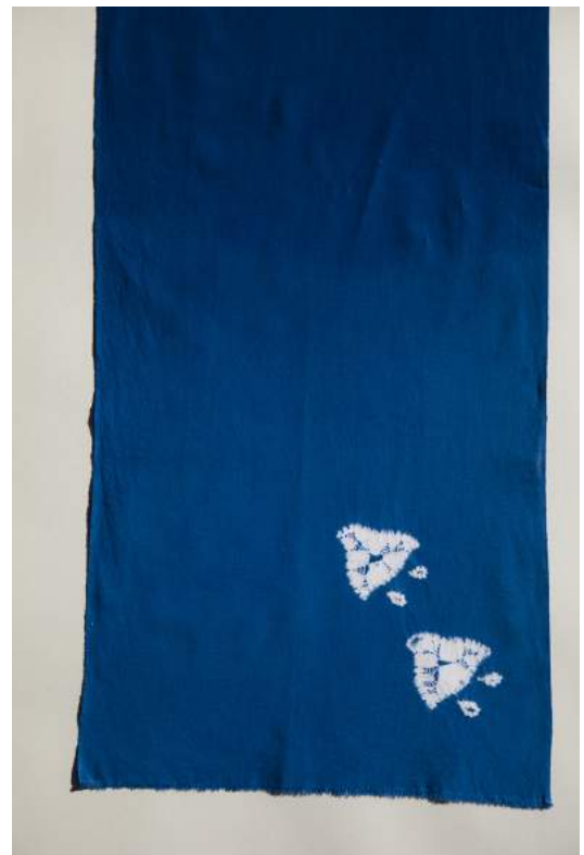
PIT-012 巻上絞り - 千鳥 - “Makiage shibori -Chidori-” Binding up -small birds-