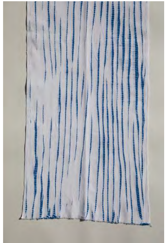
PIT-08 竜巻絞り “Tatsumaki shibori” A tornado