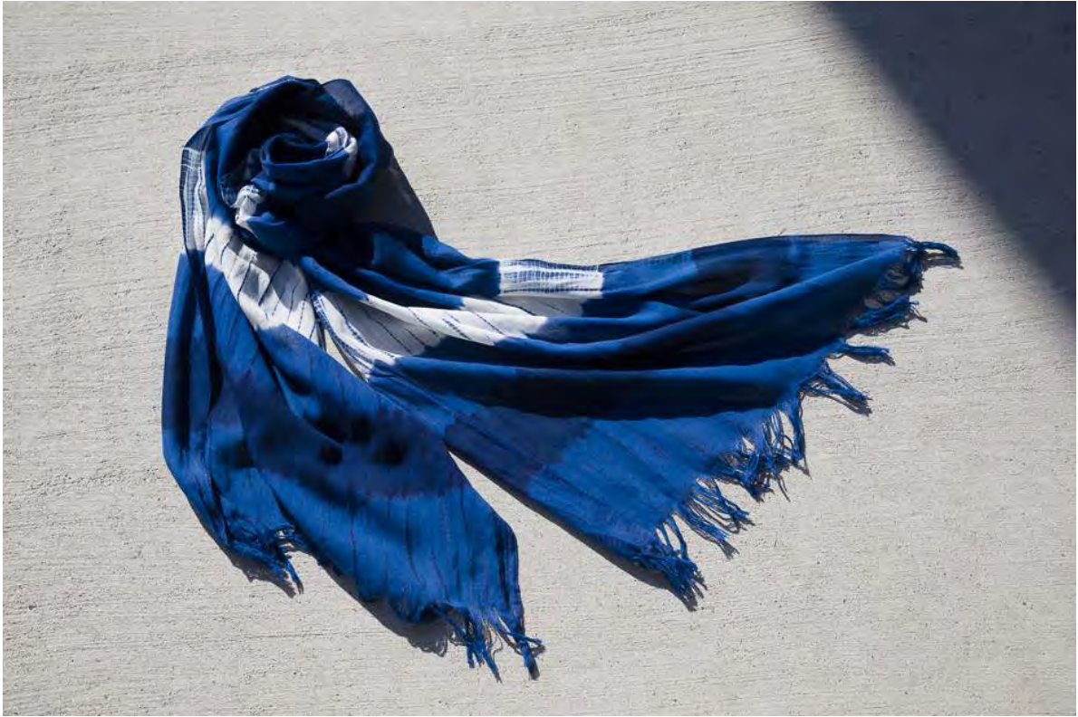
PIDLS-05 ストール 鎧段絞り / Scarf “Yoroidan shibori”