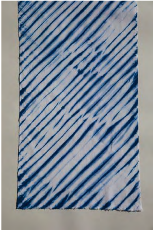
PIT-05 嵐絞り “Arashi shibori” A storm Traditional Limited Edition