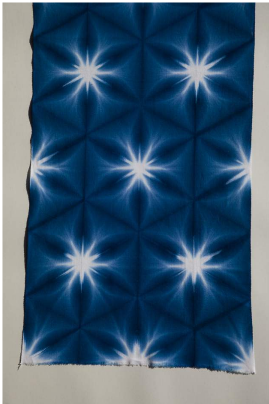
PIT-01 雪花絞り “Sekka shibori”