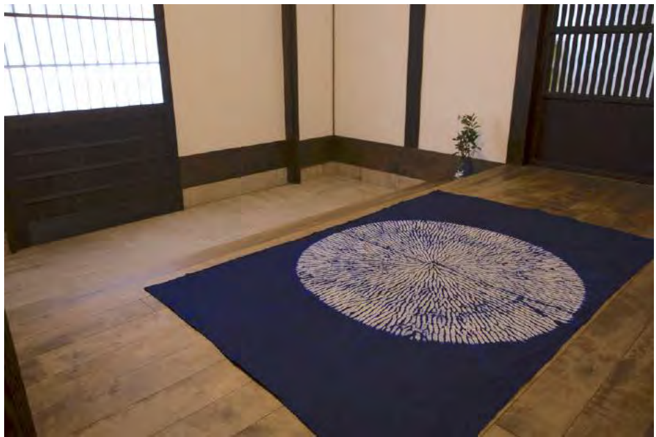
PILS-01 唐松絞り / Rug "Karamatsu shibori"