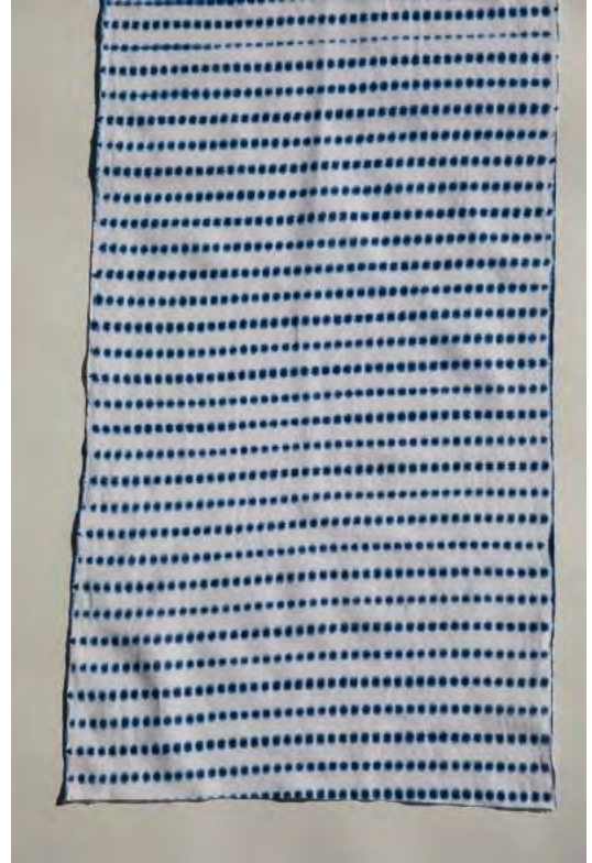
PIT-010 豆絞り “Mame shibori” beans Traditional Limited Edition