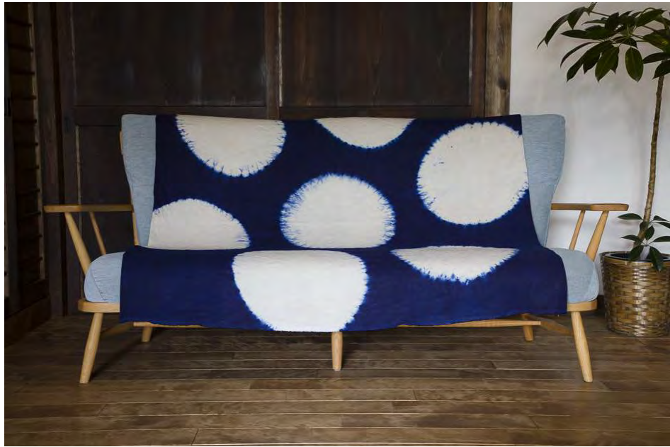
PILS-02 ラグ大帽子絞り / Rug "Oh-boushi shibori"